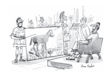
"I like the concept if we can do it with no new taxes."

Fighting Poverty Many government programs are aimed at helping the poor. The welfare system (officially called the Temporary Assistance for Needy Families program) provides a small income for some poor families. Similarly, the Food Stamp program subsidizes the purchase of food for those with low incomes,