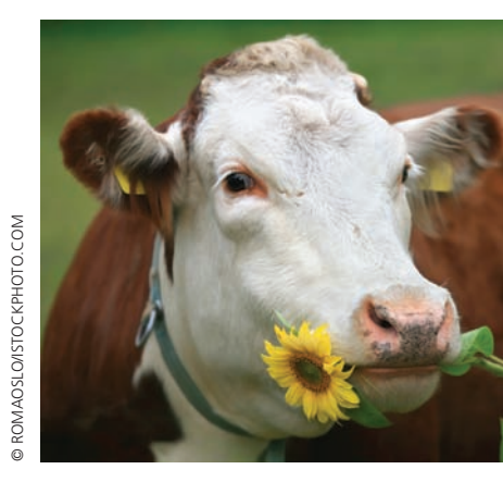
"Will the market protect me?"

Governments have tried to solve the elephant's problem in two ways. Some countries, such as Kenya, Tanzania, and Uganda, have made it illegal to kill elephants and sell their ivory. Yet these laws have been hard to enforce, and elephant populations have continued to dwindle. By contrast, other countries, such as Botswana, Malawi, Namibia, and Zimbabwe, have made elephants a private good by allowing people to kill elephants, but only those on their own property. Landowners now have an incentive to preserve the species on their own land, and as a result, elephant populations have started to rise. With private ownership and the profit motive now on its side, the African elephant might someday be as safe from extinction as the cow.