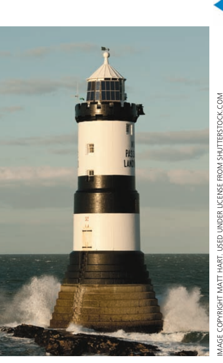
What kind of good is this?

In deciding whether something is a public good, one must determine who the beneficiaries are and whether these beneficiaries can be excluded from using the good. A free-rider problem arises when the number of beneficiaries is large and exclusion of any one of them is impossible. If a lighthouse benefits many ship