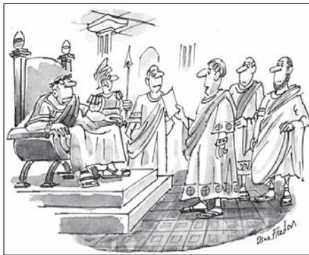
Drawing by Dana Fradon, © 1988 The New Yorker Magazine, Inc.

large-scale computer models are made up of many equations, each representing a part of the economy. After making assumptions about the path of the exogenous variables, such as monetary policy, fiscal policy, and oil prices, these models yield predictions about unemployment, inflation, and other endogenous variables. Keep in mind, however, that the validity of these predictions is only as good as the model and the forecasters' assumptions about the exogenous variables.